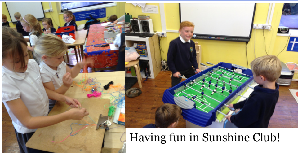
Having fun in Sunshine Club!

On Family Group Days the children are split into 5 groups with children from all years in each group. Siblings will be in the same group as each other. They will rotate around the five different activities as a group throughout the day, with the older children supporting the younger children as necessary.