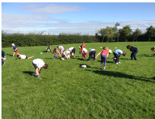
Sky Try Rugby Coaching.

Our girls' football team has participated in an inter-schools competition where they played with determination and showed good team spirit. Children in Yr 2 & 3 have been receiving weekly rugby coaching under the Sky Try Programme.