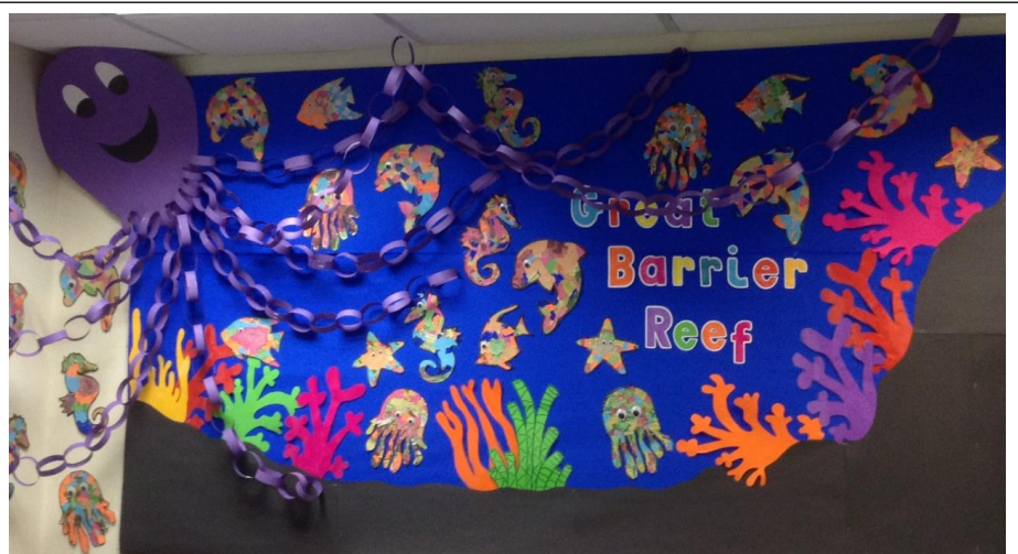
Class Australia's Great Barrier Reef display – doesn't it look fantastic?

Children in Reception, Yr 1 & Yr 2 continue to be eligible for Universal Infant Free School Meals.