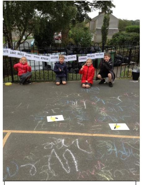
Year 4 enjoying Outdoor Maths!

Children in Reception, Yr 1 & Yr 2 continue to be eligible for Universal Infant Free School Meals.